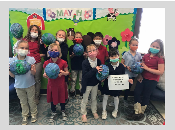
WPCS Art Club submits their work to INL'S Earth Day Contest using recycled materials.