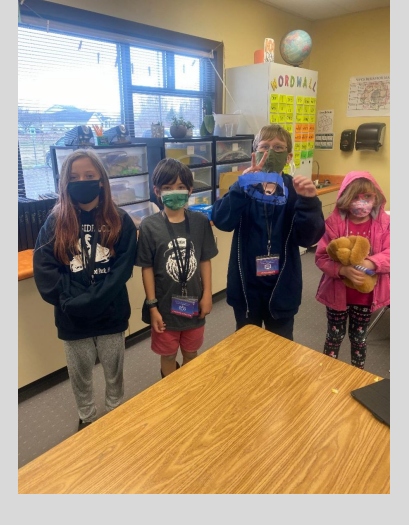
STEM Club meets to work on their INL Earth Day Competition